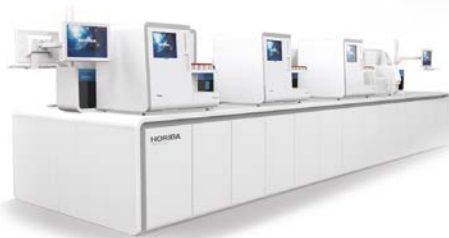
The island configuration